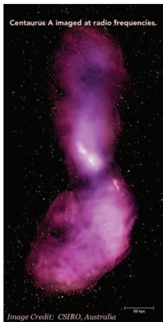
Figure 2. The twin-jets of plasma in Centaurus-A that are squirted out by its supermassive black hole and have expanded into plumes. They are most easily seen at radio frequencies.

powerful jets of plasma that leap out into intergalactic space, creating some of the most enchanting images we know (see Figure 2 ).