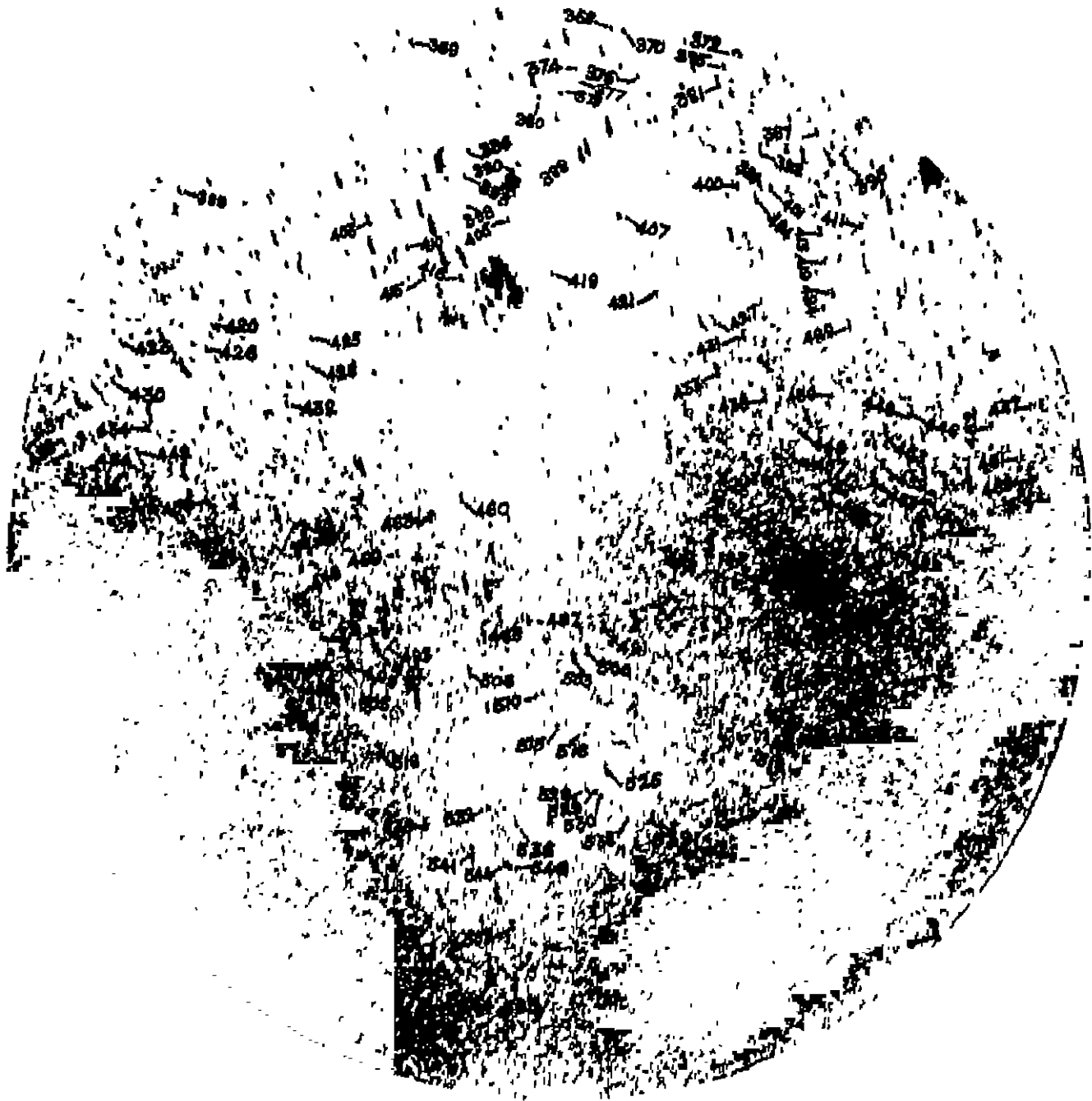
Fig 3. Red stars in the direction of LMC field B North is at the top and east towards the left.