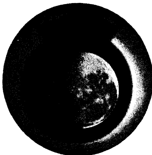
FIG. 2 — A PHOTOGRAPH OF THE MOON TAKEN AT NAINI TAL WITH THE MOON CAMERA ON 7 MAY 1958

An operation procedure for a night is as follows. The sidereal rate corresponding to the moon's declination, the speed of drift of