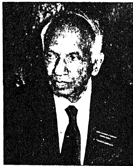
At the Golden Jubilee meeting of the Indian Academy of Sciences.

existence of the limit, and went on to speculate, presciently about stars with the density of atomic nuclei, and incorrectly about new physics – energy nonconservation – coming into play. Chandrasekhar's work was distinguished both by mathematical thoroughness and a conviction that the result was of fundamental importance. Strong conviction was badly needed, because Arthur Eddington, the Plumian Professor of Astronomy at the University of Cambridge, ridiculed the final result as an absurdity, claiming that one of the starting assumptions was in error. Since Eddington could not pinpoint the error in a manner acceptable to physi-