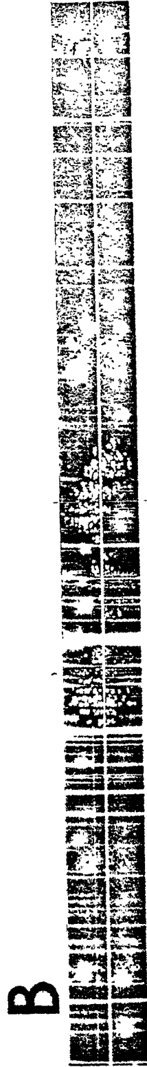
Solar Rotation Plate. Latitude 10^{\circ}8 . D region (red to left).

Evershed, New Method of Using a Spectrograph for Solar Rotation Work.