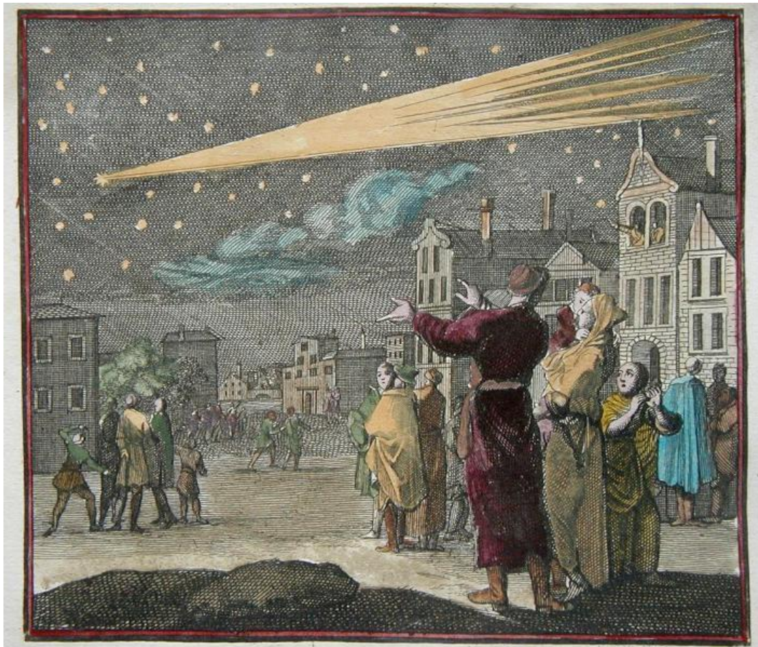
A German engraving of the Great Comet of 1680; printed in 1707

compared to the distance of 0.45 R_{\odot} from the surface of the Sun what Comet Lovejoy (C/2011 W3), also a Kreutz family Sungrazer discovered on Dec 2, 2011 by Tony Lovejoy, passed by during its perihelion passage on Dec 16, 2011. The Comet Lovejoy is supposedly a smaller comet in comparison to the Comet ISON. While coursing through the turbulent environs, the Comet Lovejoy had the risk of total destruction. However, it belied all apprehensions and survived the close encounter with the Sun. The movement of the Comet Lovejoy with its wriggling tail and its emergence from behind the Sun about an hour later is vividly revealed in a Solar Dynamics Observatory footage ( http://science.nasa.gov/science-news/science-at-nasa/2011/16dec_cometlovejoy/ ). The Kreutz family comets have typically small cores, just a few tens of metres or so. According to Matthew Knight, the core of the Comet Lovejoy therefore had to be larger, at least about 0.5 km as to survive the kind of mass loss it would have suffered due to solar heating. On Oct 21, 1965, the great comet Ikeya-Seki passed its perihelion ( q=1.7 R_{\odot} ) and was noticed to have fragmented just before perihelion by T Hirayama and F Moriyama while carrying out its coronagraphic observations.