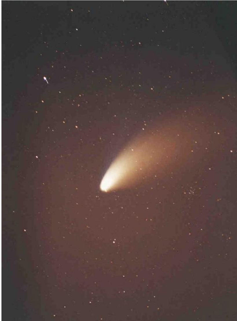
Comet Hale-Bopp (C/1995 O1): the Great Comet of 1997

in which the orbits lie close to plane of the planetary orbits and the comets move around the Sun in the same direction as the planets. The Oort Cloud is centered on the Sun and extends from 10,000 to about 100,000 AU with the cometary orbits completely randomly oriented.