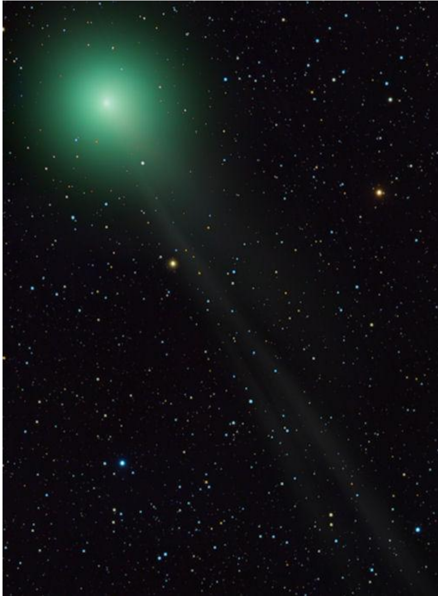
Comet Lemmon: on Jan 28, 2013, taken by Rolf Olsen (Source http://spaceweather.com/ ).