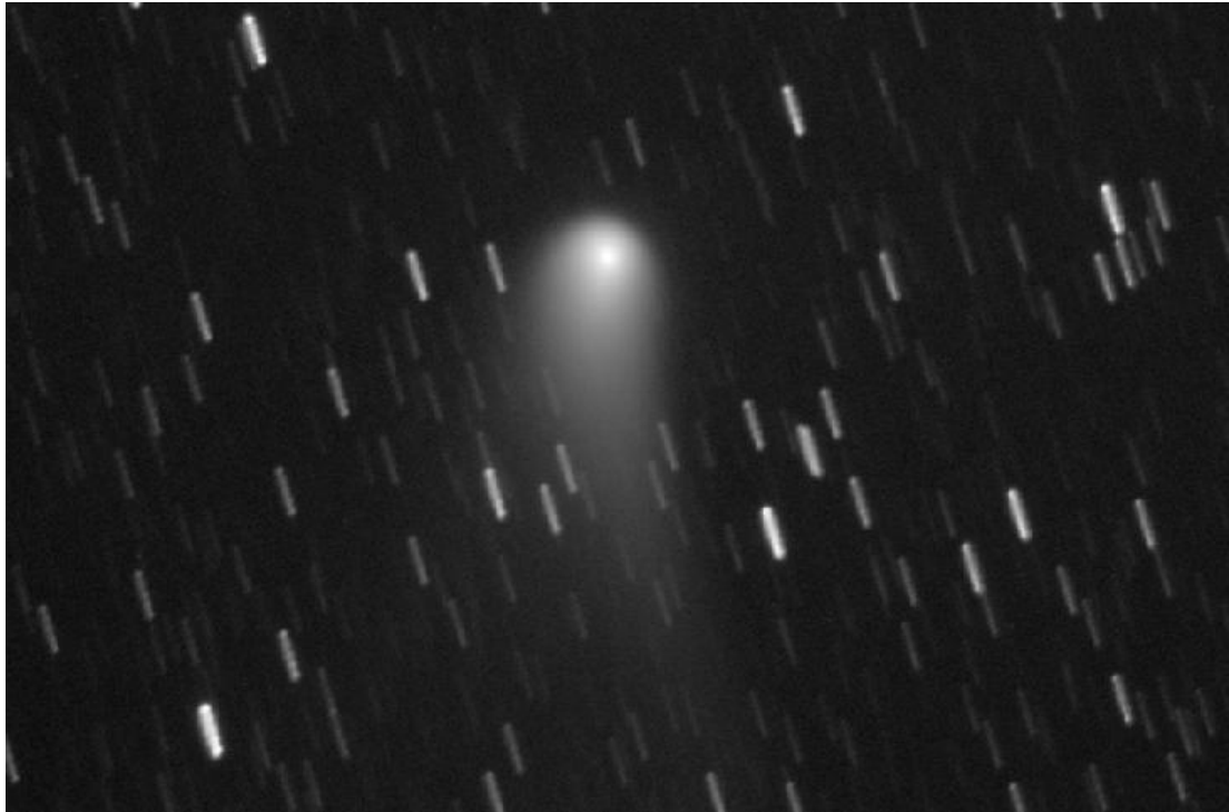
Comet PanSTARRS, Jan 23, 2013, with the 0.3m F(Photometric Robotic Atmospheric Monitor—FRAM, Argentina.

detect and study Earth approaching bodies – asteroids and comets that might be hazardous. The comet was named after the telescope itself. Its pre-discovery images were recovered quickly and an orbit could be computed within two days of the discovery. The comet Pan-STARRS passes its perihelion in March 2013 when it should become very bright, brighter than 0 mag, and be visible naked eye. It will pass closest by the Earth on Mar 5 from 1.097 AU and its perihelion on Mar 10 when it will be an evening object. It shall begin to lead the Sun from Mar 29.