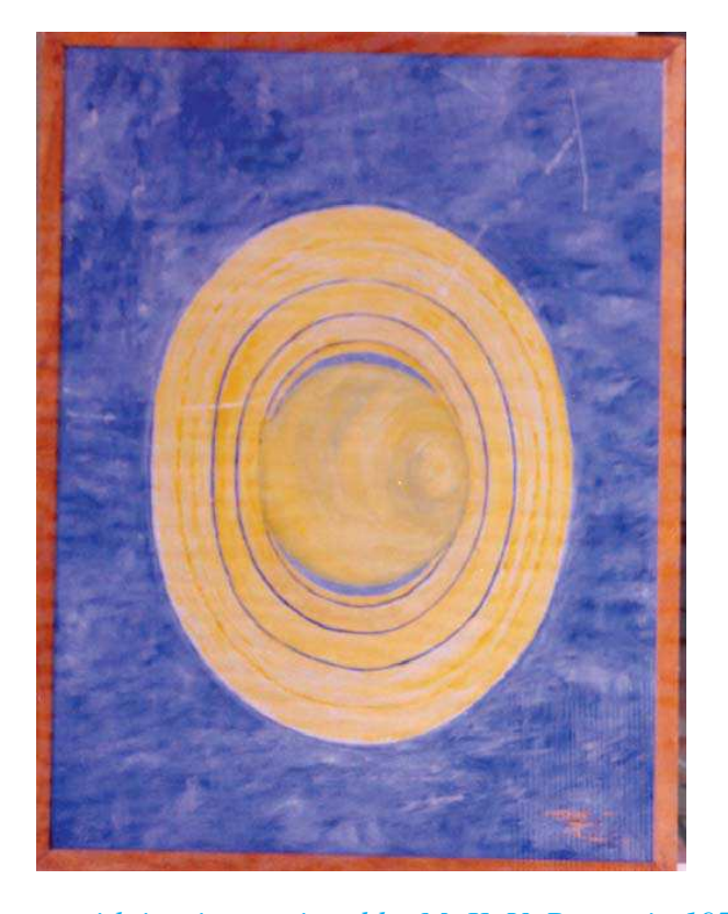
Uranus with its rings painted by M. K. V. Bappu in 1979.