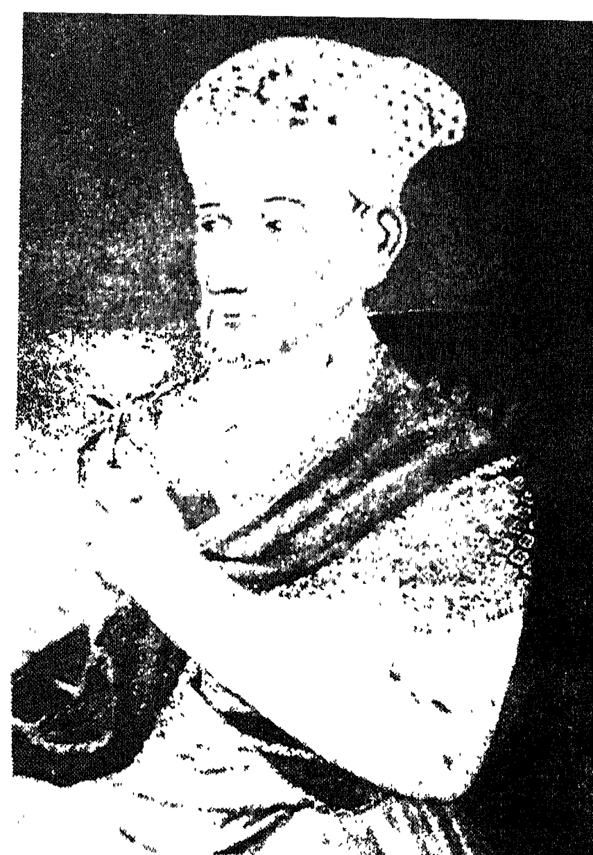
Figure 2. Maneckji Lowji Wadia (1720–92), the second master builder of Bombay dockyards 1774–92.

In the first phase of shipbuilding the emphasis had been on repairs and construction of coastal boats for protection. The things however soon changed. Increasing prosperity of the east India company meant building of bigger and larger number of ships in England. This and the marine rivalry in Europe resulted in large scale felling of oak trees in Britain. Accordingly in 1772 the company was prohibited from building any large ships. They were asked instead to either build their vessels in India or colonies or to charter vessels built there. Preservation of British oak forests was one reason. Superiority of teak over oak was another. Oak contains lignic acid 'which corrodes and consumes the very metal (iron) which is employed to unite and secure it in the various forms into which it is converted for the purposes of naval architecture'. In contrast teak 'abounds with oleaginous particles, the best and certain defence of iron from corrosion by the action of the acid'. In addition 'teak was not disposed to splinter to the same extent as oak' and thus 'the effect of shot upon teak is far less dangerous than upon oak' 10 .